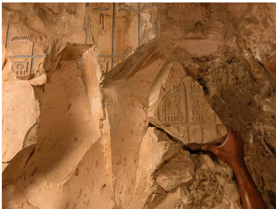
Fig. 6: The block Anx 281 back to its original position

When we reached the tomb we verified our assumptions about the block that we supposed coming from the southern part of the First Pillared Hall East wall. They demonstrated to be correct (Fig. 6).