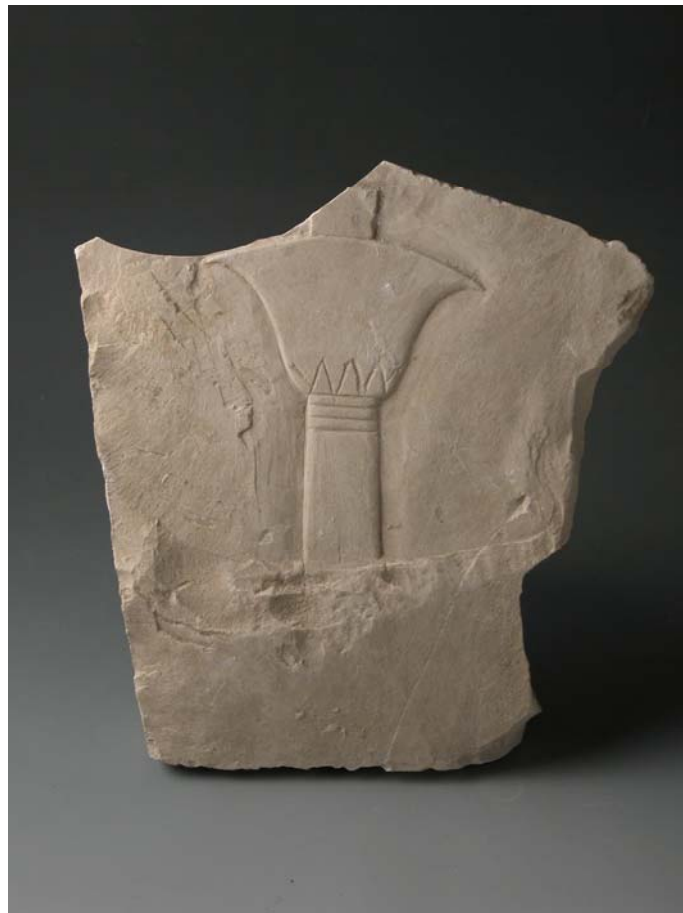
Fig. 5: Limestone slab with the sketch of a column with papyrus capital

The huge layer of debris also yielded (discovered in March not far from the first group of jar fragments) two other inscribed limestone ostraca: one bears the beginning of the “Teaching of a man to his son” and the other a hieratic text consisting of a line repeated twice by different hands, followed by three other lines starting with what seems to be a name. The latter seems to be a simple exercise of a scribe and the two ostraca could be interpreted as remains of some scholastic activities that took place in the surroundings. The nature of the other findings made in connection with the two ostraca would reinforce such an interpretation. Not far we also uncovered a small slab of limestone used as an artist trial piece (it is carved with the sketch of a column with papyrus capital, fig. 5) and an unfinished limestone shabty.