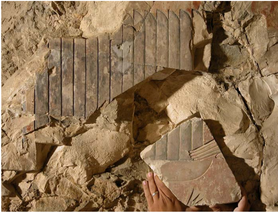
Fig. 2: the decorated block found in the vestibule back to its original position

Fragments of the decoration coming from the tomb of Harwa were also found among the antiquities stored in the vestibule. They probably were found when the MMA Archaeological Mission partly cleared the floor of the vestibule and they were left there. One of the fragments proved to be part of the large scene carved in the South part of the first pillared hall Eastern wall (Fig. 2).