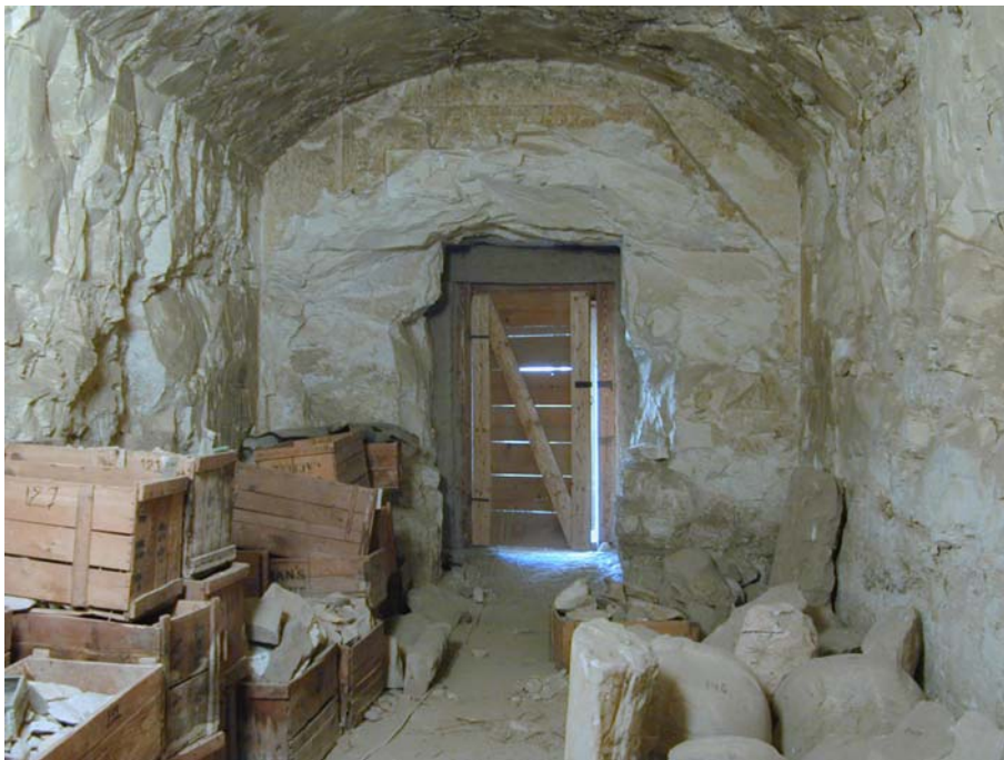
Fig. 1: The Northern part of the vestibule with the wooden door and the mud-bricks frame provided by the MMA Archaeological Mission

The MMA Archaeological Mission partly excavated the vestibule (to around 50 cm over the floor level). They walled up the passage leading to the outside portico and provided the entrance to the courtyard of the tomb of Harwa with a wooden door framed by a mud-brick wall (Fig. 1).