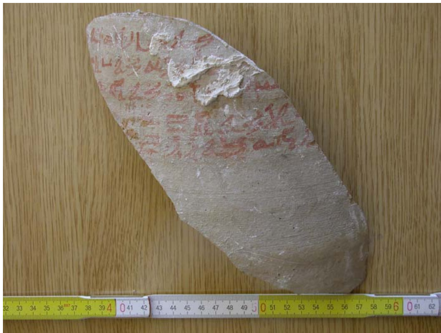
Fig. 3: Shard of the jar with the hieratic inscription painted in red ink

In March, in correspondence of the western edge of the mound (Square B4), we had the surprise to find some limestone ostraca, a fragment of a papyrus and the pieces of a large jar with two hieratic texts: one painted in black ink - and mostly faded away - and another painted in red ink (Fig. 3).